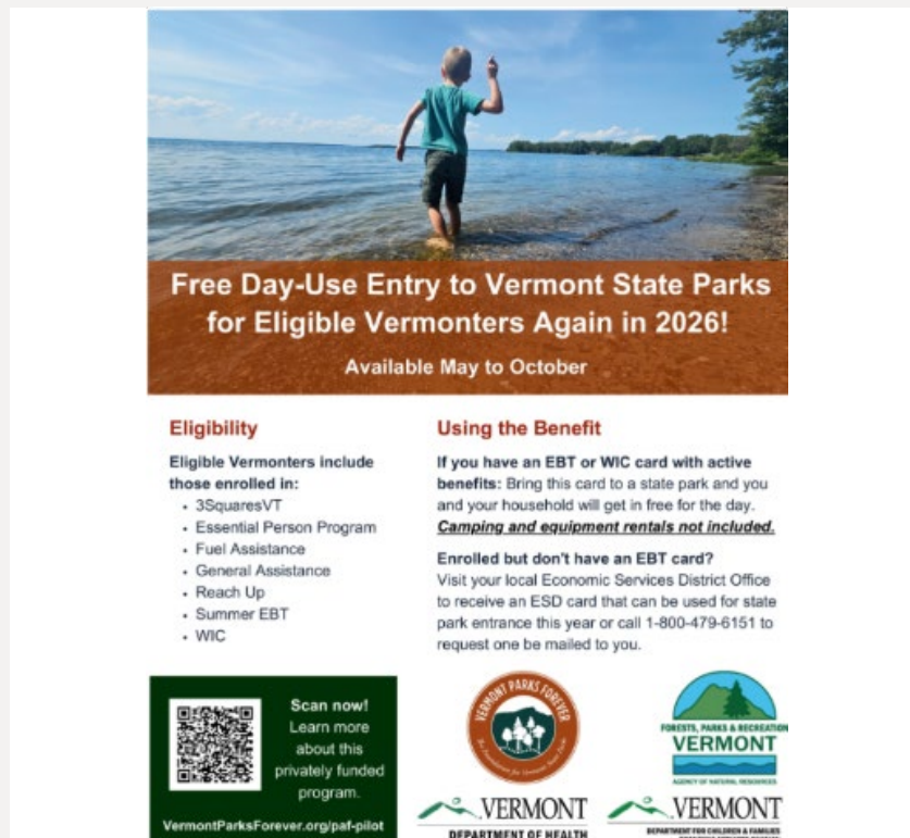
Flyer with accessing benefits information. Picture child standing in water throwing a rock.