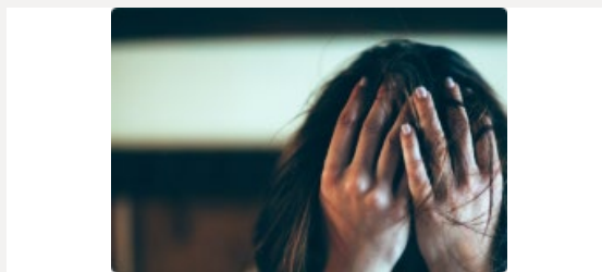
Youth with long brown hair covering their face with hands.