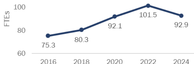
Acupuncturist FTEs by Year