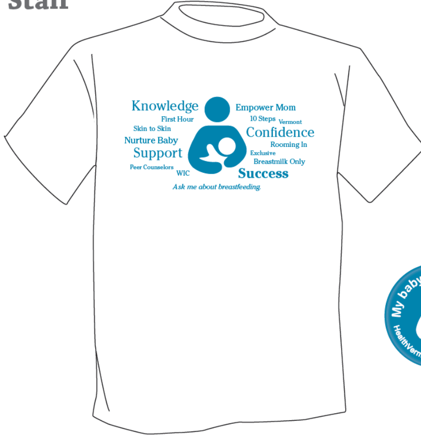
T-Shirt shirt shape representational only