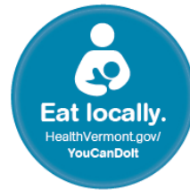
Buttons actual size